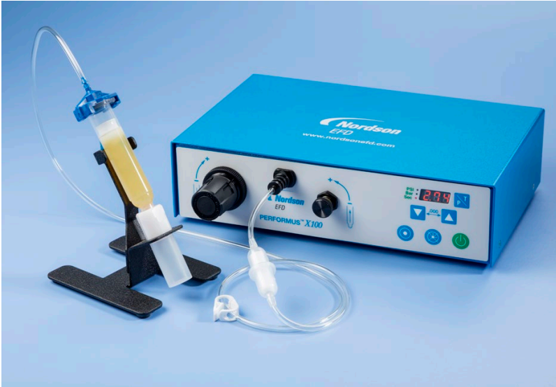
Performus X dispensers provide reliable dispensing for general applications in a wide range of industries.

Reliable benchtop fluid dispensing control for general applications