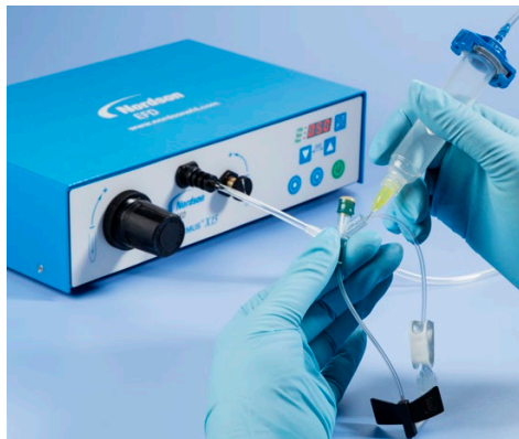
Dispensing a low-viscosity solvent on medical devices.

Nordson EFD's Performus™ X dispensers increase throughput, improve yields, and reduce production costs through controlled application of adhesives, lubricants, and other assembly fluids.