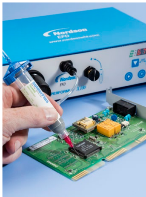
Dispensing SolderPlus® solder paste on PCB boards.