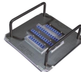
LC/PC 40 axis Fixture

I.P.C. (Independent Pressure Control) Technology