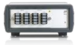
PT5 Polarity Tester