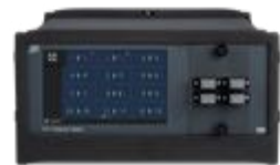
PT1 Polarity Tester